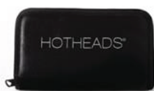
X155 - HH Weft Tool Pouch with items X151, X152, X153 and X154 inside