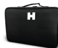
X200 - HH Case