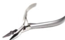
X152 - HH Weft Plier 5" w/channels