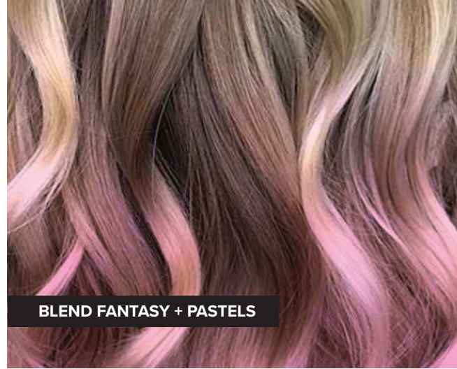
BLEND FANTASY + PASTELS

To reserve your spot please contact your Premier Beauty Consultant.