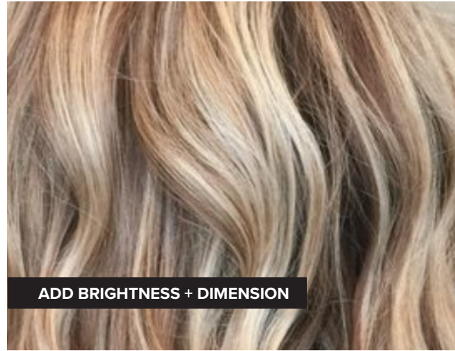
ADD BRIGHTNESS + DIMENSION