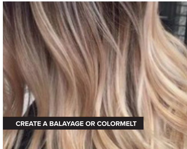
CREATE A BALAYAGE OR COLORMELT